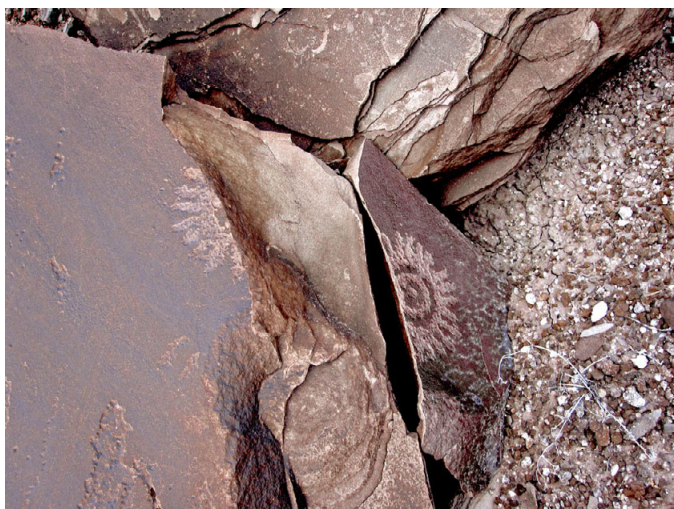
Figure 3. Loss of rock due to fractures independent of the sandstone bedding plane cut across the sun motif on this rock art panel in Petrified Forest National Park.

Raw scores over 60 indicate that the stability of the rock art panel is in severe danger. Due to the precarious position of the stone slab on the steep slope, the student researcher decided to take matters into her own hands by using her academic skills to petition the National Park Service (NPS) for its entry into the museum collection, rather than lose the panel and its cultural context to the erosion of the underlying bentonite clay. Although NPS initially declined the petition, the student researcher was authorized to periodically reassess it, and update the site managers on the condition of the rock and slope. On each visit to the park, this student always makes it a point to reassess this panel, keeping close tabs on it, and reporting even the slightest change in its position. Overall, this student gained experience in NPS policy, communication skills, and environmental analysis. She also decided to major in Physical Geography, and is now pursuing her bachelor's degree at Arizona State University.