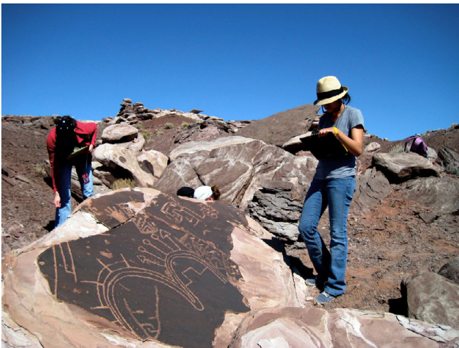
Figure 1. Student RASI recorders in the Petrified Forest National Park analyze damage to a rock art panel impacted by the natural weathering process of case hardening (photograph by Niccole V. Cerveny).

In the summer of 2009, our National Science Foundation(NSF)-funded RASI project brought us to a site in the central portion of the Petrified Forest National Park. A rock art panel containing three canine glyphs had completely detached along the bedding plane of the sandstone bedrock (Figure 2). Student researcher Janica Webster completed a RASI analysis, and determined a raw score of 62 for the panel.