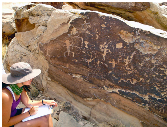
Figure 4. This image has many glyphs, but also much weathering. Trained RASI researchers can distinguish between natural weathering forms and processes—such as flaking, lithobiont pitting, and weathering rind flaking—and anthropogenically carved images (photograph by Casey D. Allen).

Although not on a steep slope, the second panel highlighted is of an apparent sun motif (Figure 3). The loss of this element is due to fracturing of the rock across the sandstone bedding planes, and lack of support at the edge of the rock due to undercutting. This panel earned a raw RASI score of 26, a stability status of good. The core of the rock is very stable, yet an entire glyph has been lost on its edge. Noting this overall condition is part of the RASI assessment, and seeing the researcher's analysis, a site manager might